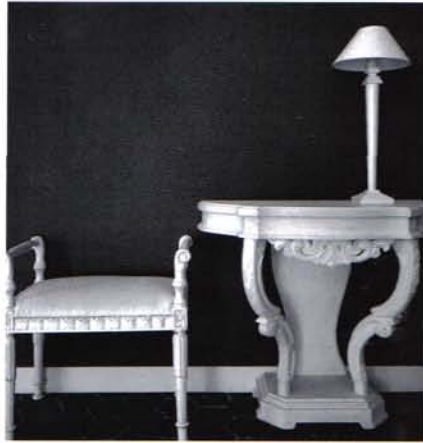
Maximum impact, minimum expense – the interiors have been curated with great flair