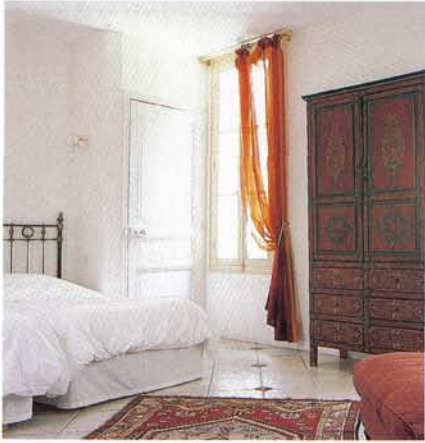
Villa Mauresque's suites are all individual; this one is bright, white and distinctly Oriental