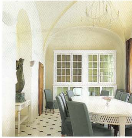
Rather than convert all available space into guest rooms, the proprietors preserved the open atmosphere of a villa