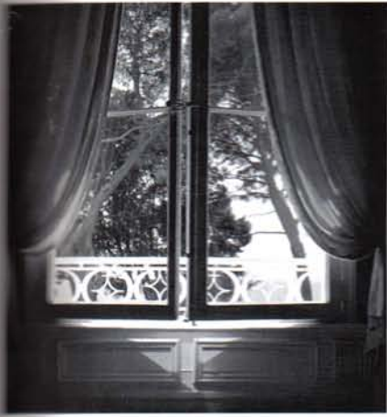
Generous windows with panoramic views of the Mediterranean: this is the South of France the way it used to be