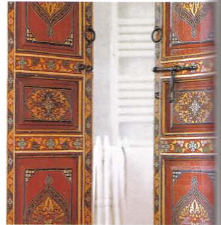
Right down to the doors, the decorative detailing is completely in step with the villa's Moorish inspiration